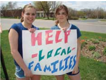
Youth Advisory Board members attracting dirty car drivers to their car wash.