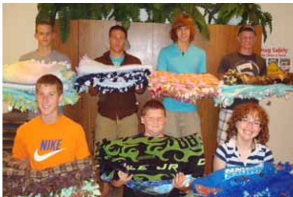
A portion of the Forest Lake Youth Advisory Board members who did a car wash and raised money to make fleece blankets for Forest Lake families in need.