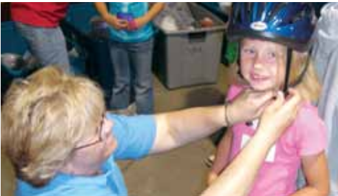
Safety Camper getting fitted for a brand new bike helmet.

"LAYSB was there for me at a critical time in my adolescence. I made great friends, learned life skills, and truly bettered myself by being a part of the agency. Now, as a volunteer, I am able to give back to the agency and help continue the wonderful services that they offer to youth and adults that truly need them as I once did." Volunteer