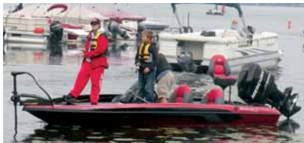
Fishing team participating in Sunrise Bassmasters Youth Fishing Tournament.

Allstate Giving campaign Ameriprise Financial Employee Gift Matching Campaign St. Croix Valley Foundation Thomson Reuters Workplace Giving Campaign