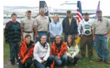
Sunrise Bassmasters annually contribute funds from their Fall Fishing Tournament.