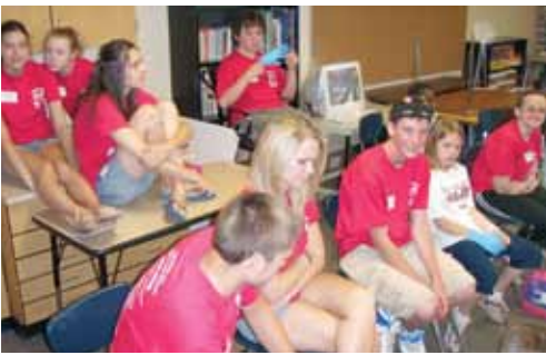
Safety Camp volunteer junior counselors.