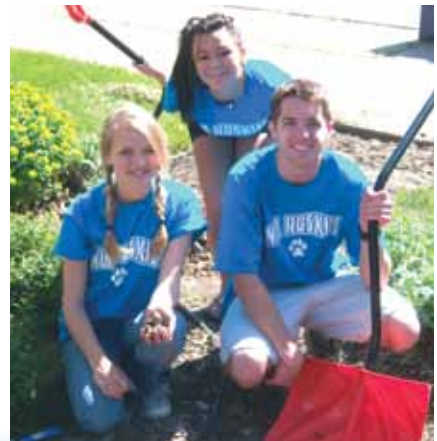
North Lakes Academy volunteers cleaning up LAYSB's Peace Garden.