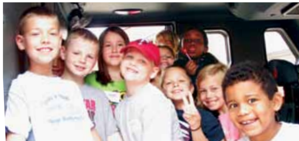
Forest Lake Safety Campers inside an emergency vehicle.