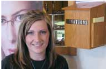
Associated Eye Care repairs clients glasses at no charge and instead encourages a donation be given to LAYSB.