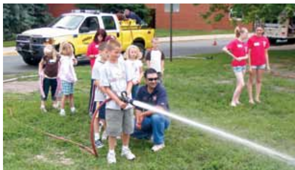
Forest Lake Fireman with Safety Camp participants.

"LAYSB gave me the opportunity to grow during a time when my environment was shaky and needed stability. I will forever be grateful for that." Youth